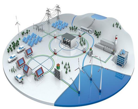
Fig. 1. Advances smart grid concept.

Aim of earlier grid is to afford electricity to the consumer in enhanced way. Therefore it has only one way communication concerning uncertain communication technologies. The necessity of development in grid can be satisfied by usage of digital technology. Transformation from analog to digital electricity infrastructure introduces the challenge of communication security. Earlier, role of protection system is limited to infrastructure and equipments but smart grid system is more complex, fast and handles bulk data hence requires much more pointed protection arrangement than earlier. As shown in Fig. 1, earlier for supporting grid infrastructure, protection and control was applied in adhoc manner but with smart grid "safeguard" safety has occurred in far great role. To overcome the security threat, protection part is widely increased.